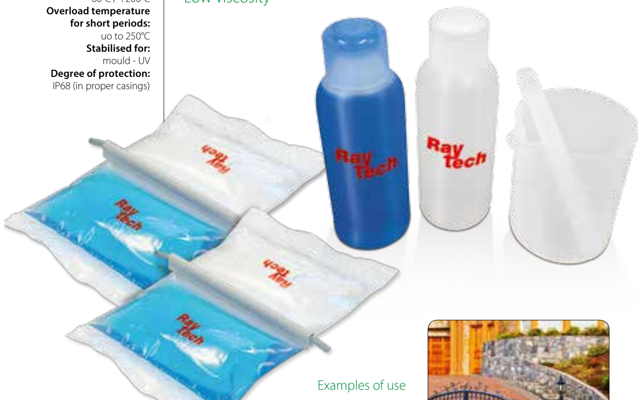
Examples of use