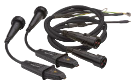
+ DH4-C probe 1.5 m leads