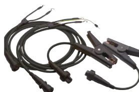
+ KC1 Kelvin clip 3 m leads