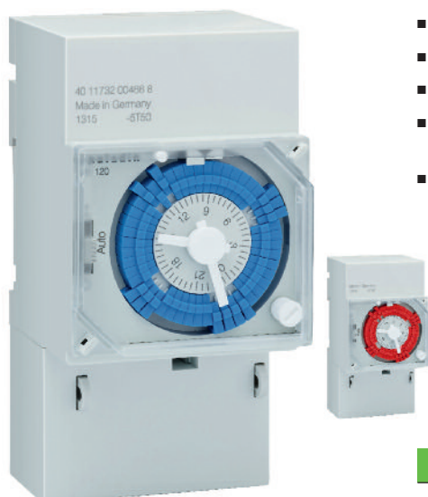
13x 120 (daily program)